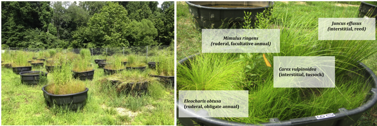
Fig. 1. Wetland mesocosms for the study and planting diversity (PD) represented by four macrophytes native to, and commonly planted in, created/restored wetlands in Virginia.

specific species combinations. The CV was determined using the following formula: